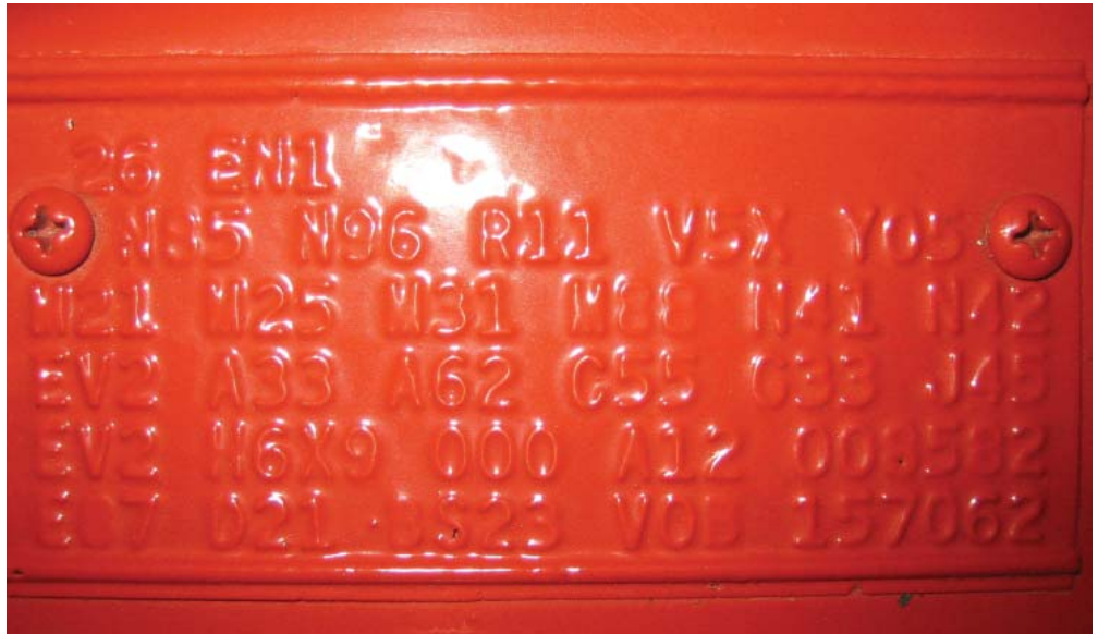
Your car's birthmarks

Prior to 1968, many manufacturers did not have a VIN stamp on the block. This makes learning date codes and having concrete documentation that much more important. Certain high performance cars, such as Corvettes, 1965-67 289 "K code"-equipped Fords and Shelys, did have the VIN on their engine blocks. Post-1968, all cars have at least the last six digits of their serial number somewhere on the engine block and transmission case.